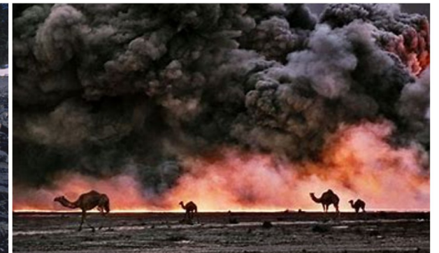
Kuwait War Spills